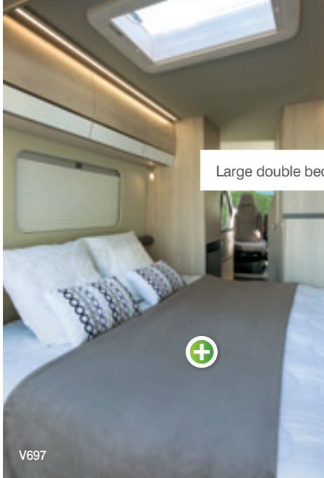
Large double bed or twin beds: you choose!