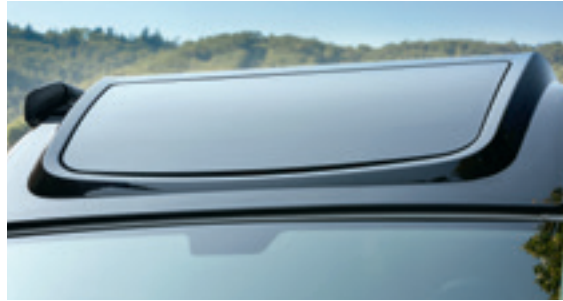
Panoramic View (in option).

Chausson offers a van concept based on an all inclusive numbered edition. With designed decals and all the best equipments, all your travels will be unique... just like your Chausson 33 Line.