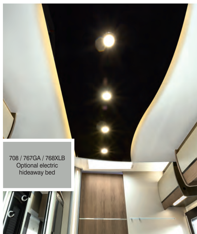
708 / 767GA / 768XLB Optional electric hideaway bed