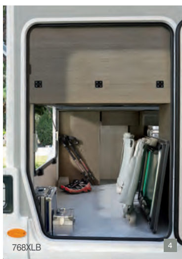
4,5) EasyBed: garage lower/upper position